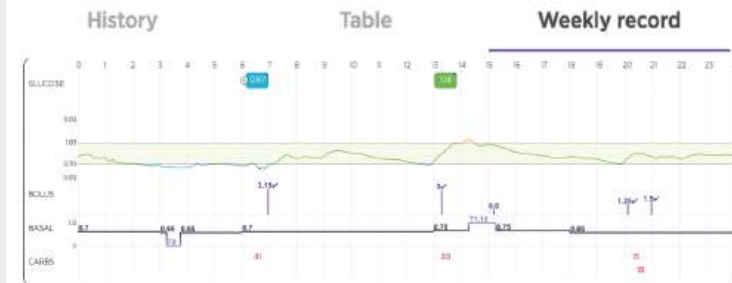
Example of data from a glucose monitor and an insulin pump

To view your daily curves, click on Weekly